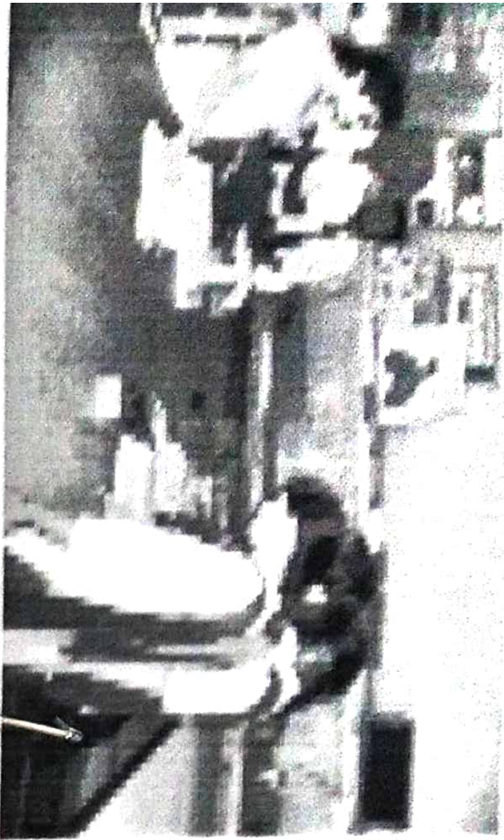
CHEMISTRY LAB PHOTO